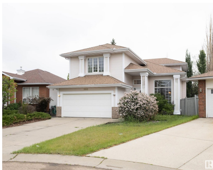
11511 12 Ave NW, Edmonton, AB